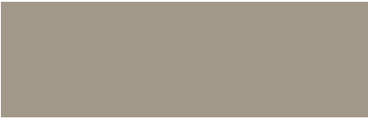
#22 Light Gray