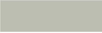
#21 Dove Gray