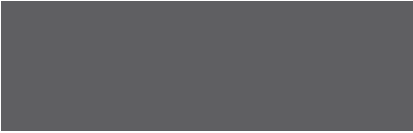
#76 Dark Gray