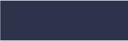
#16 Slate Blue