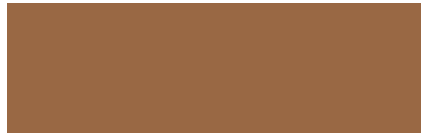
#51 Terra Cotta