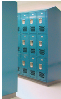
Lockers & Benches