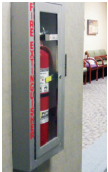
Extinguishers & Cabinets