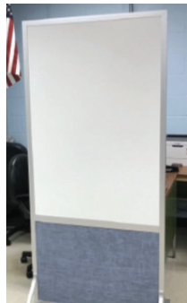
Visual Display Boards